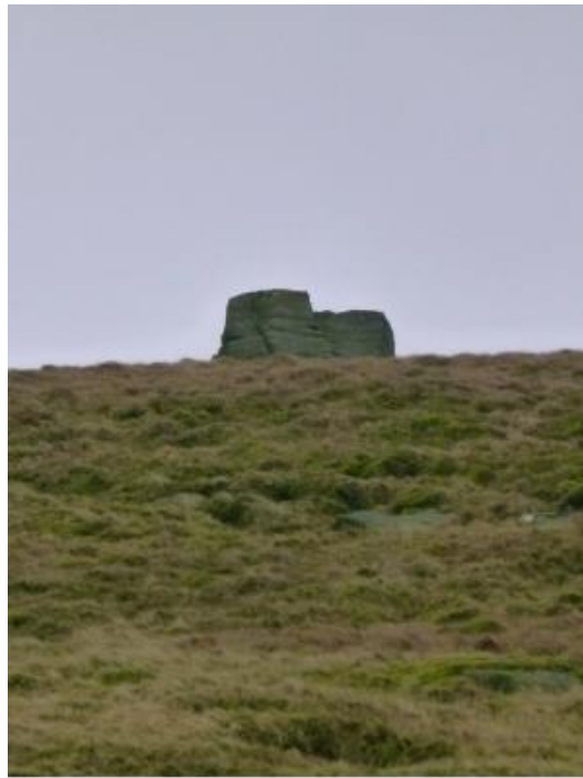
Rock "Aiming Point"

Once you get to this outcrop, just continue uphill and you will soon see the wall which runs along the ridge. I arrived just by a large flat rock (SD 997593). Turn right at the wall.